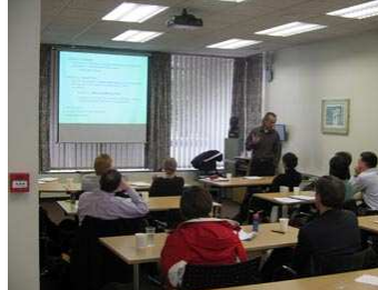
Above: Institutions Workshop