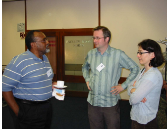
Below: Mobility Conference